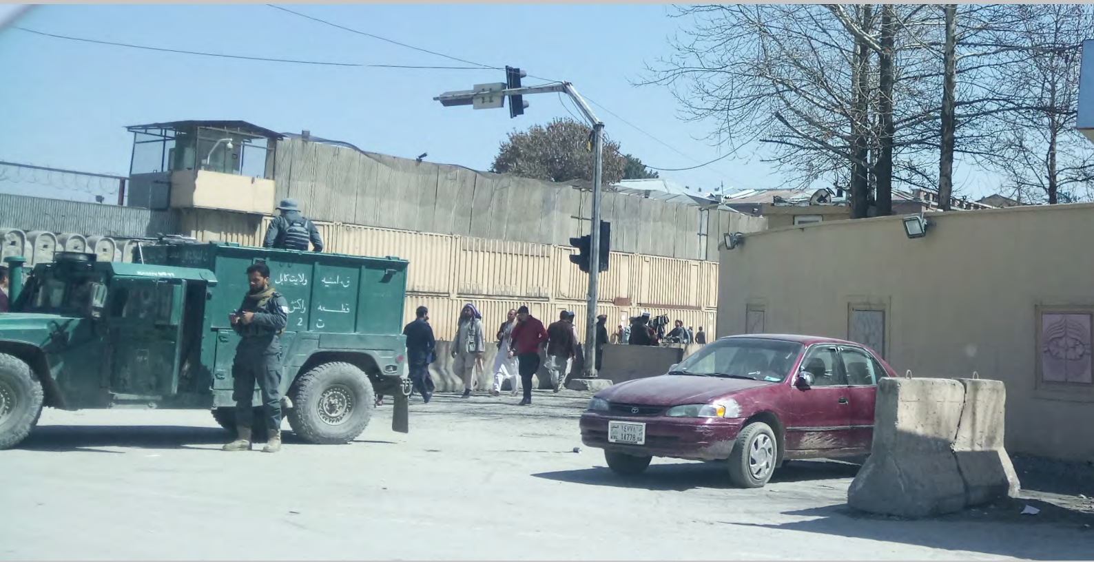
Security precautions in Kabul city centre, 2020.