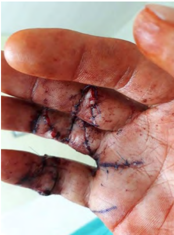
Hand injury suffered shortly before deportation.

agreement between the German Federal Government and the Ministry of Repatriation and Refugees that seriously ill persons will not be deported and, if need be, not accepted in Kabul. However, so far only two people are known to have been denied entry due to illness. 242 Among those who were accepted, are several in acute need of treatment for whom diagnoses by German doctors are available. These include chronic diseases such as diabetes with a permanent need for insulin as well as hepatitis B and C. Those with injuries from occupational accidents, such as the hand injuries suffered by two deportees, were also accepted. One had been diagnosed as having permanently limited mobility of his hand; the other was arrested and deported on his way to the hospital for further treatment two weeks after his operation. Yet another was at risk of becoming deaf due to an ear disease if he was not operated. There are also a number of deportees for whom further investigation of acute medical complaints had been arranged but not yet undertaken. This includes one person who needed to undergo an eye operation in Kabul to save his sight.