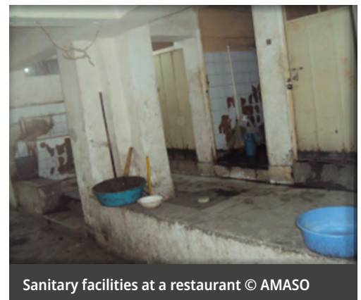
Sanitary facilities at a restaurant

As a result of the coronavirus pandemic, many lost their accommodation because these establishments had to close temporarily; deportees reported that accommodation was also denied or withdrawn after the temporary lockdown due to colds that were interpreted as Covid-19. This concerned accommodation with relatives or acquaintances as well as in shared rooms. Apart from hotel rooms, it needs to be assumed that there is no chance of maintaining social distancing nor of having access to clean water. 237 Nor is it imaginable that basic personal hygiene can be maintained in shared rooms and restaurants, simply because the sanitary facilities are more or less public.