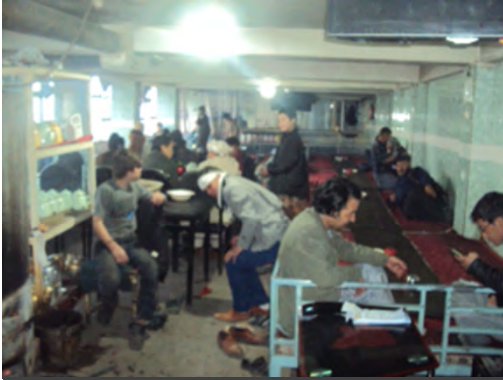
Communal dining and sleeping room in the restaurant

In privately organised hiding places, deportees often pay not only rent but also for not being betrayed. While regular rented flats are available from AFN 5,000/EUR 53.20 per month depending on the location, 235 deportees sometimes have to pay up to AFN 8,000/EUR 85.20 per month in rent for a room even with close relatives who have their own living space – and sometimes they are required to pay the rent of the entire family to be allowed to stay there themselves. Among the deportees, up to EUR 300 has been demanded so far by relatives.