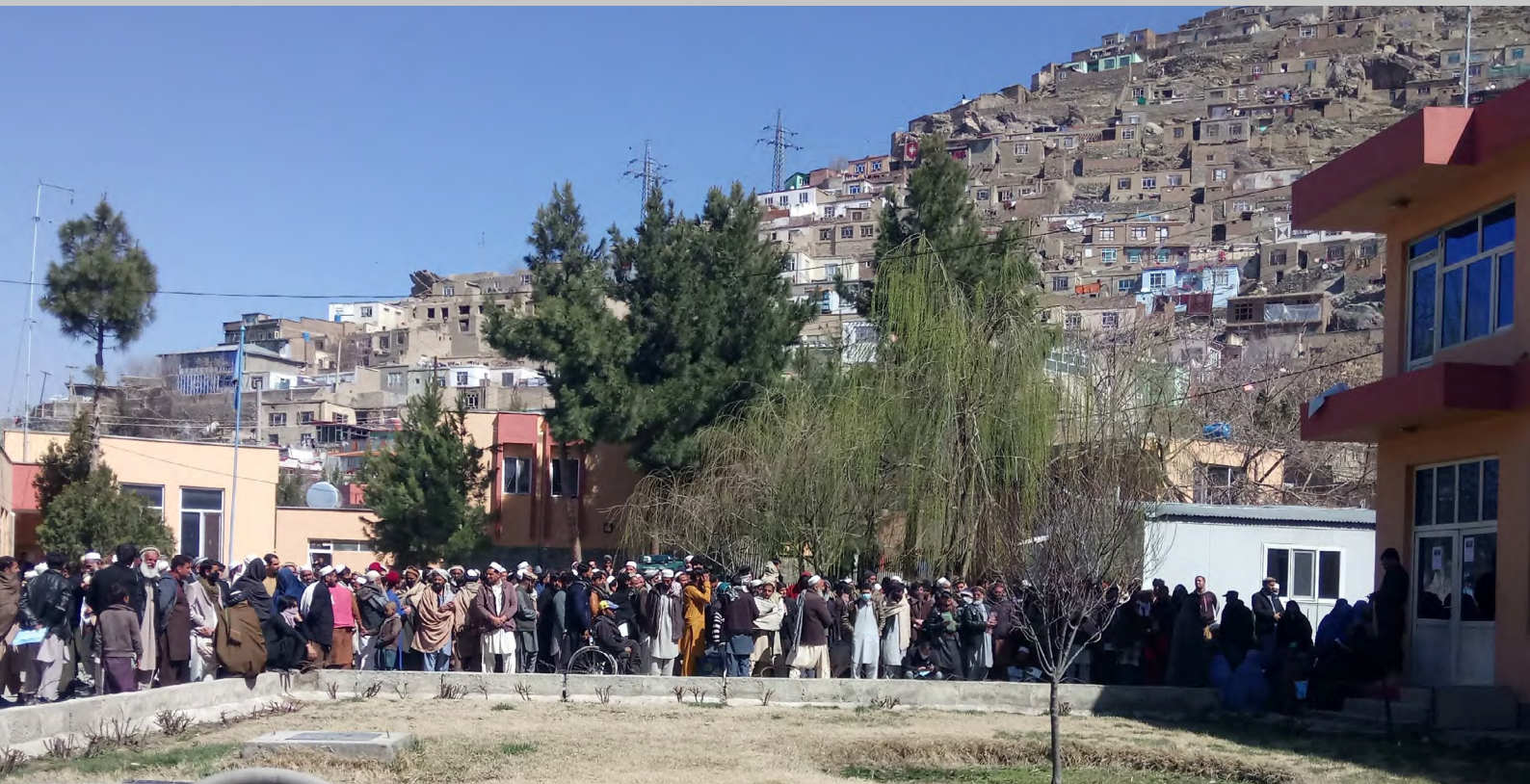
Delegation of internally displaced persons at the MoRR with a petition for land allocation – shortly before they were chased away with canes. Kabul, 2020.