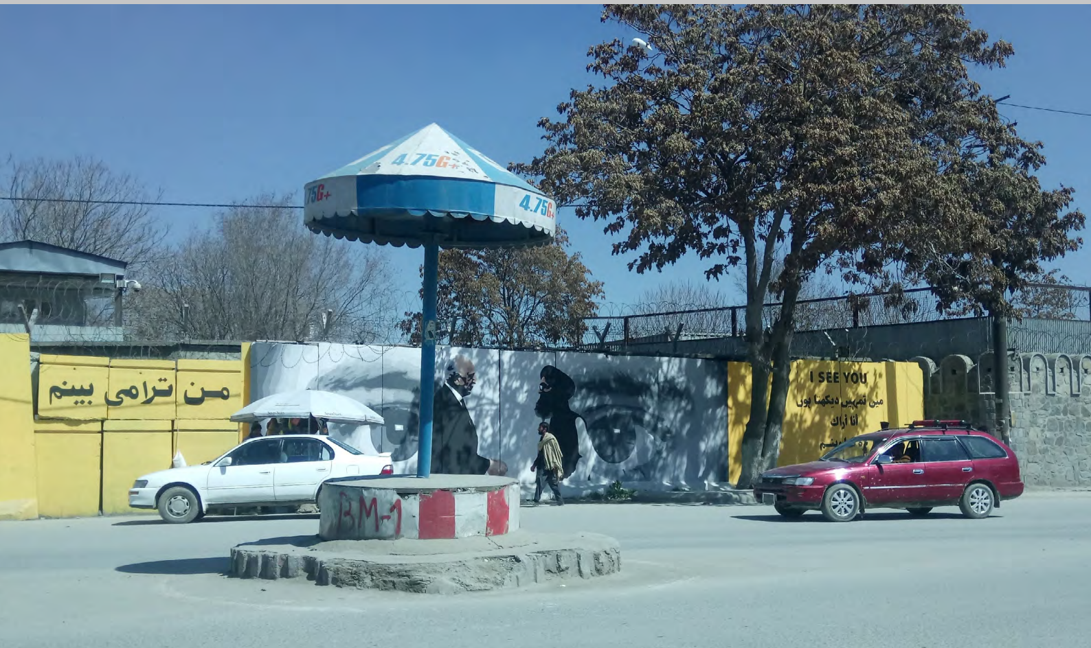
StreetArt by the artist collective ArtLords. Handshake between Zalmay Khalilzad and Mullah Baradar, the negotiators of the Doha agreement in February 2020 – with civil society watching them closely without a right to a say in the matter. Kabul, 2020.